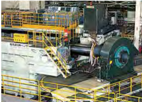
High-Frequency Pipe Bender