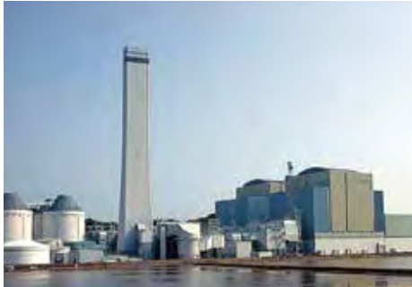
1,050 MW Coal-Fired Once-Through Boiler