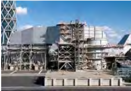
FGD (Flue Gas Desulfurization Plant for Coal-Fired Boiler [1,000 MW]) Wet Limestone-Gypsum Process