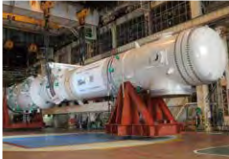
Integrated Coal Gasification Combined Cycle Gasifier