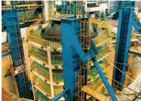
Pressure Vessel Hydrostatic Test Pit