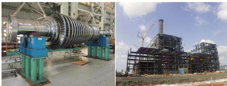
Figure 3 NTPC Khargone (manufacturing and construction state)