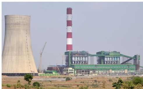
Mitsubishi Hitachi Power Systems, Ltd.

The joint venture boiler company L&T-MHPS Boilers Private Ltd. (LMB), and the joint venture turbine/generator company L&T-MHPS Turbine Generators Private Ltd. (LMTG), which were established jointly by Mitsubishi Hitachi Power Systems, Ltd. (MHPS) and Larsen & Toubro (L&T) to construct high-reliability and high-performance ultra-supercritical coal-fired thermal power plants in India, a country facing constant power shortages, are marking their 10th anniversaries in 2017. Mitsubishi Electric Corporation (MELCO) also participates in LMTG as a contributor.