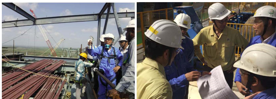
Figure 5 Project audit and improvement activities