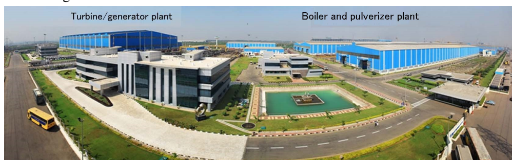
Figure 1 LMB/LMTG Hazira Plant

To "resolve the constant power supply shortage" in India and "utilize the abundant coal resources in the country," and also respond to needs for "the introduction of high-performance coal-fired thermal power generation technology with excellent environmental compatibility" and "the development of domestic industries," MHPS established LMB and LMTG jointly with L&T in 2007, and built a boiler and steam turbine/generator manufacturing plant in Hazira, Gujarat State in Western India ( Figure 1 ). In 2009, we added a pulverizer manufacturing plant and a foundry to produce pulverizers, which are main pieces of boiler equipment, and large casting parts of steam turbine casings.